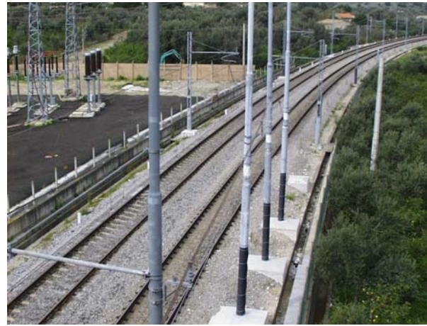
DOUBLE-TRACK RAILWAY LINE