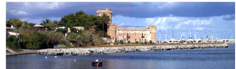
POST OPERAM VIEW