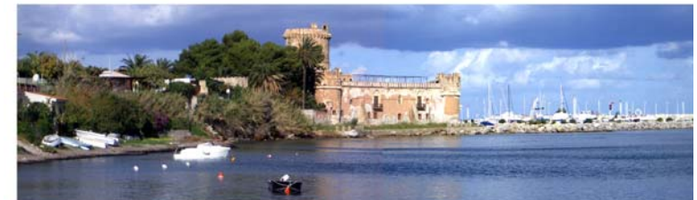
ANTE OPERAM VIEW